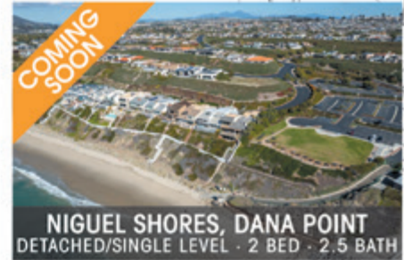
NIGUEL SHORES, DANA POINT DETACHED/SINGLE LEVEL · 2 BED · 2.5 BATH