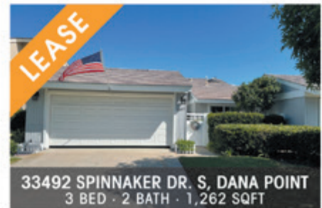
33492 SPINNAKER DR. S, DANA POINT 3 BED · 2 BATH · 1,262 SQFT