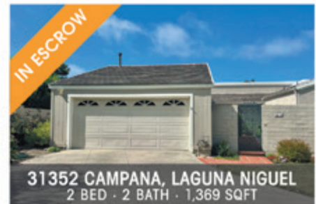
31352 CAMPANA, LAGUNA NIGUEL 2 BED · 2 BATH · 1,369 SQFT