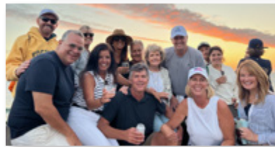
Jon Cobain's Birthday (top) and Labor Day (below).