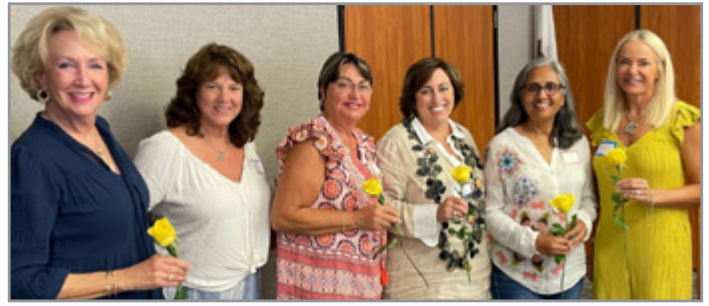
New members receive yellow roses at the September meeting.