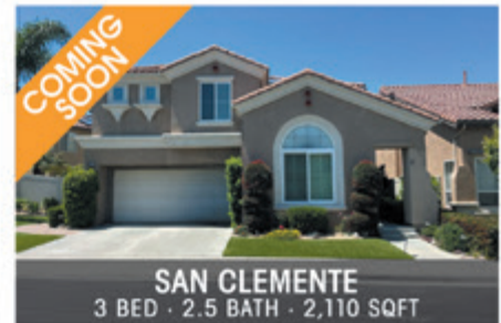
SAN CLEMENTE 3 BED · 2.5 BATH · 2,110 SQFT