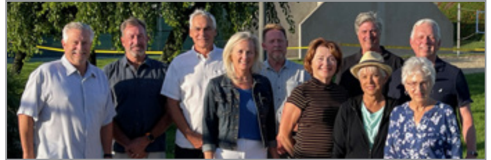
Representatives from the NSCA Board and the Recreation Amenities Committee gather in September as fencing, demolition, and site clearance begin for the Amenities Enhancement Project.

Recreation Amenities Enhancement Report —The amenities project construction has begun! Our general contractor Land Forms began mobilization on September 11 with the initial focus on construction fencing, demolition and site clearance. Earthwork and drainage will be the primary focus in October with major concrete work in November. For your safety, please adhere to the construction signs and avoid the fenced-in areas at all times.