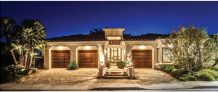
SOLD - 27 MARBELLA! $4,700,000