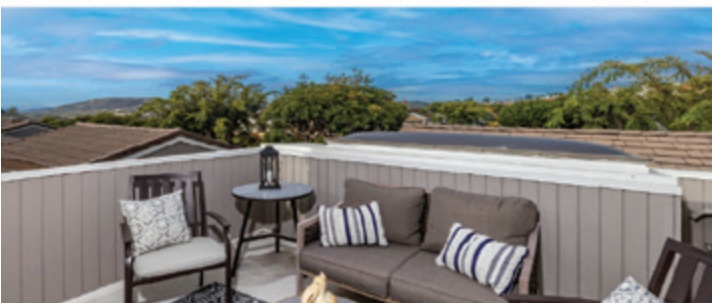
SOLD - 33961 MANTA COURT! $1,655,000