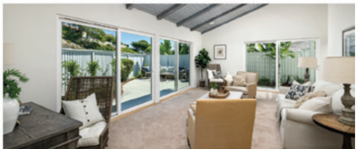
SOLD - 33932 FAEROE BAY! $1,475,000