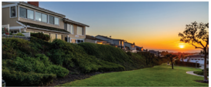
SOLD - 24121 WINDWARD DR! $2,285,000