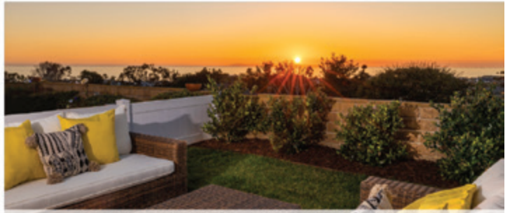
SOLD - 33865 MANTA CT! $2,300,000