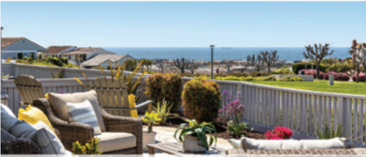
SOLD - 33471 SPINNAKER DR! $2,595,000