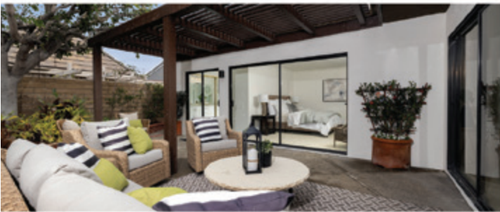
SOLD - 23831 MARMARA BAY! $2,050,000