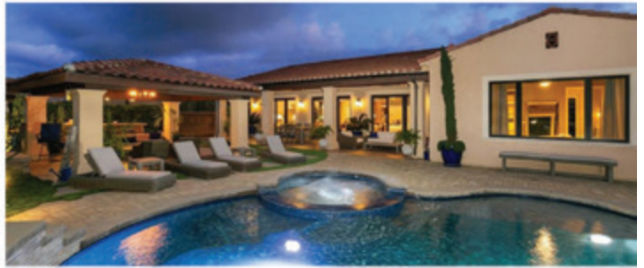
SOLD - 32210 VIA ANGELICA! $4,600,000