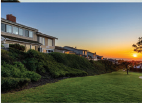
SOLD - 24121 WINDWARD DR!