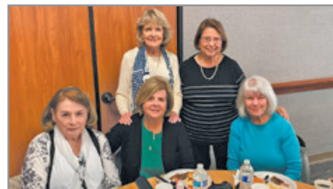
Representatives from the NSCA Communication Committee spoke at the Men's Club breakfast on March 7 about the 50-year tradition of the Seashore News .

We all know to expect delivery of the Seashore News right to our front door on the first of every month. You may not have noticed the Seashore News is also available