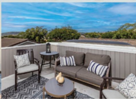
SOLD - 33961 MANTA COURT!