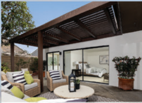
IN ESCROW - 23831 MARMARA BAY!