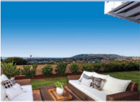
FOR SALE - 33865 MANTA CT!