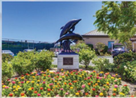
COMING SOON - SEA TERRACE!