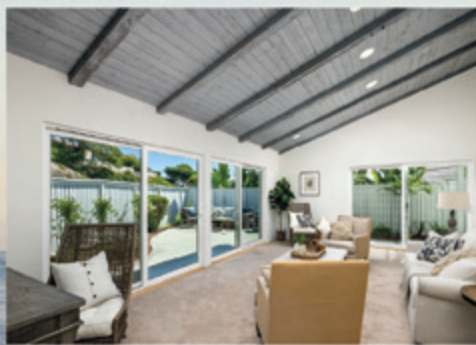
SOLD - 33932 FAEROE BAY!