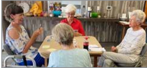
Niguel Shores residents enjoy Bridge each Wednesday at 11 a.m. in the Clubhouse.