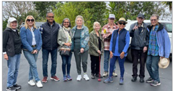
Field Trip to Hortense Miller Garden