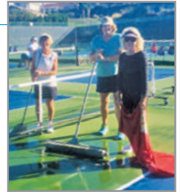
Players mop the courts after an October rain shower. Rain or shine, we are ready to play.