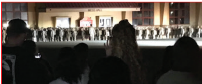
The Marine Corps League welcomes Marines of the 2/1 returning from Afghanistan to Camp Pendleton.