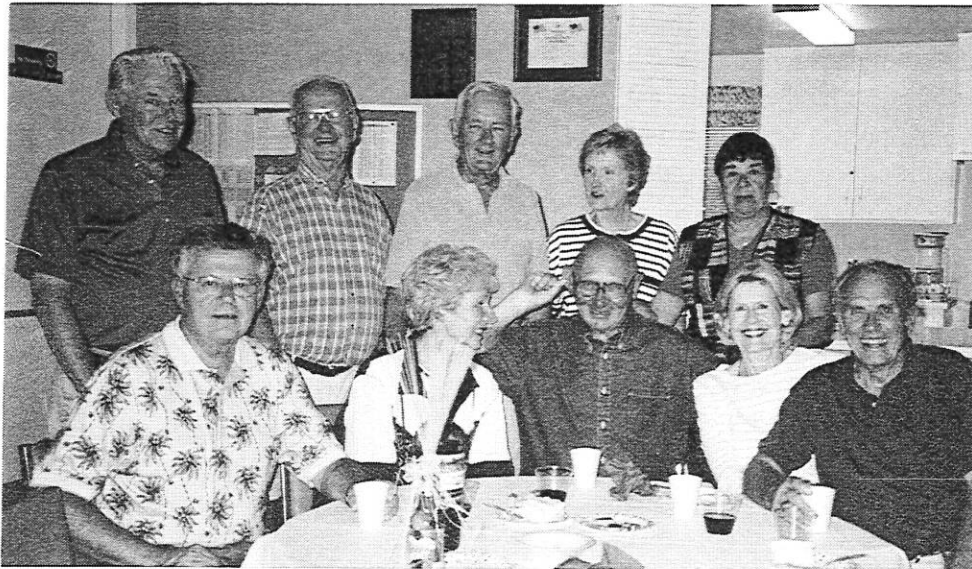
Mens Club committee that prepared a pasta dinner for the club and their guests. Committee enjoying a little camaraderie following the pasta dinner hosted by the Mens Club.