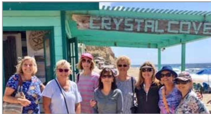
Members enjoy a day at Crystal Cove Beach and Beachcomber Cafe.