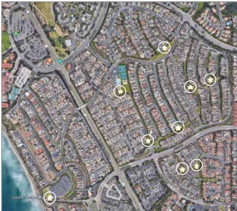
Pet Waste Station Locations

Pet Waste Station Locations: A map of pet waste station locations is shown and can be found on the website. These stations are placed throughout the community as an added amenity. Please make sure as a responsible dog owner that