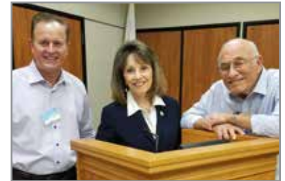
Senator Pat Bates

On September 17, Senator Pat Bates , who represents Dana Point in California's 36 th Senate District, provided a comprehensive review of the legislative results of a super-majority opposition party. They passed a $215 billion budget with a $22 billion surplus while giving free medical care to illegal aliens. They re-