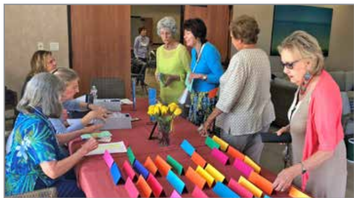
Members arrive for the first Women's Club Meeting of the new season.