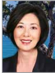
Supervisor Lisa Bartlett

At our September 3 meeting we heard from former Dana Point Mayor and now Chairman of the OC Board of Supervisors and District 5 Supervisor Lisa Bartlett , who provided a refreshing pro-citizen update on Orange County. On the subject of transportation it seems that political tension inhibits the extension of the 241 Toll Road with local politics ensuring that it never happens. Freeway (only in California do you call a toll road a freeway) rights of way in Orange County are built out.