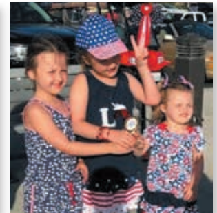
Most Patriotic Wagon Dillon Family