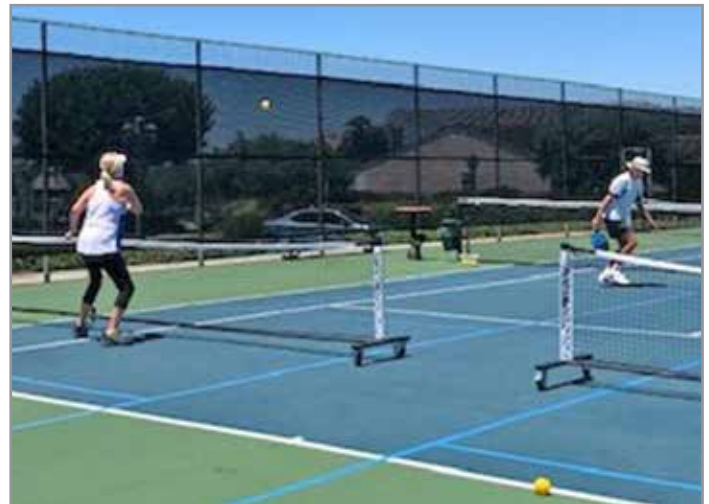
A sunny Saturday morning on Court #1 with Pickleball in play.