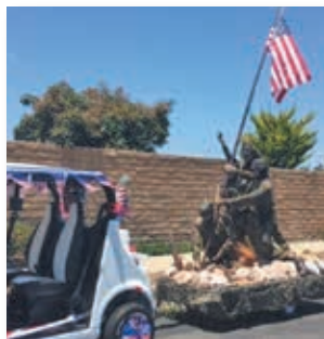
Judges Choice Iwo Jima Memorial