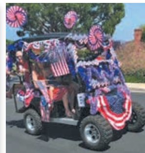
Most Patriotic Cart Bushnell