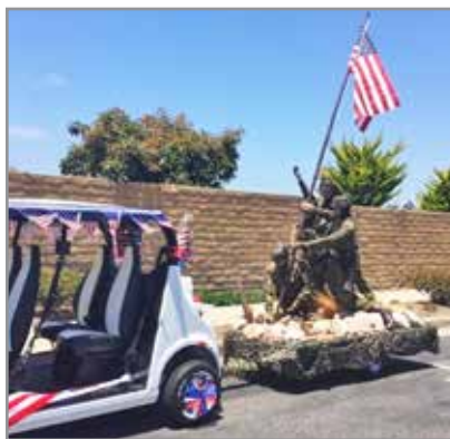
Stan and Ron's "Freedom: Iwo Jima"

of freedom and victory symbolized by the high-flying flag and the depiction of brave men who fought for freedom.