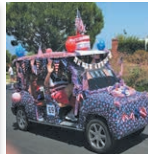
Most Creative Cart Jenkins