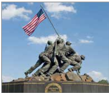
The USMC Iwo Jima Memorial in Washington, D.C.

First, they studied the background and sculpting of the actual