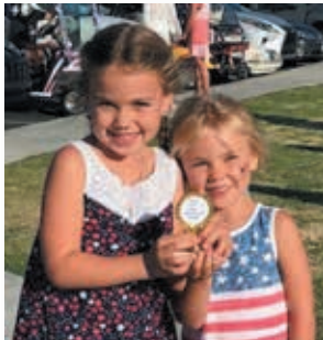
Most Creative Wagon Miller Girls