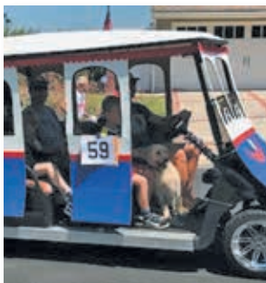
Most Creative Cart Dohner