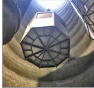
The access point lift for the tunnel project.