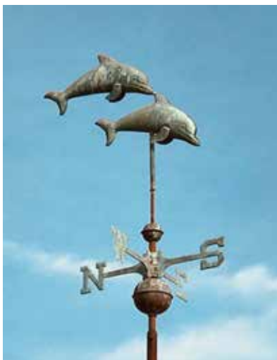
BRIGANTINE DOLPHINS — These twin dolphins have measured the wind on Brigantine for 30 years.