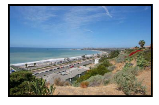
Harboring the Good Life