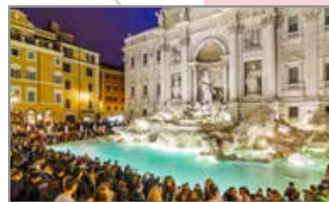
Trevi at night

Sandy and Ray Homicz offered another caution. "One summer evening our tour group took a walk from our hotel in Rome in search of—you guessed it—gelato! We came upon a gelato shop just steps from the Trevi Fountain . The scene looked magical with the Trevi lighted up at night and