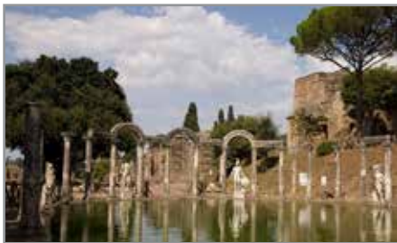
Hadrian's Villa Canopus

that, we secured our valuables while out for evening strolls and things went smoothly the rest of the trip.”