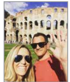
Coliseum in Rome

And, when in Rome, you surely will find yourself at tourist magnets like the Coliseum or Forum or Pantheon . Fodor's Travel Guide cautions that the costumed soldiers and gladiators on the street are freelancers hoping you will want your picture taken with one of them. Be sure to clarify in advance what their fee would be for posing with you.