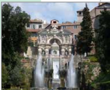
Villa d'Este Tivoli Rome

Villa d'Este is a Sixteenth Century palace with beautiful terraced gardens designed by Ligorio, a piazza of ancient giant cypress trees, and a spec-