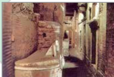
Scavi Necropolis Tour at Vatican