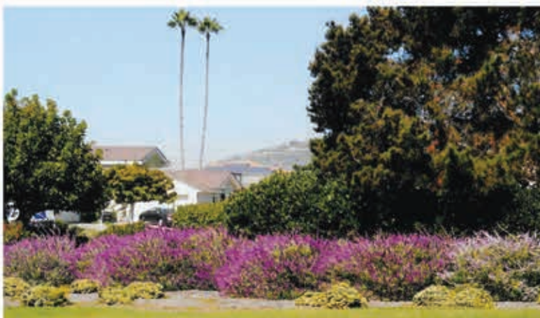
Mexican Bush Sage Salvia Leucantha