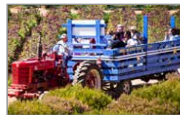
Wagon ride through the flower fields.

As I write this report there is a storm hitting the East Coast, and the thought arises that we are so fortunate to live in Southern California where it is always beautiful, sunny, and hardly rains. Oh wait. Whoops! I see outside my driveway is wet and rain is falling. That's great too! Our gardens do need the wet stuff.