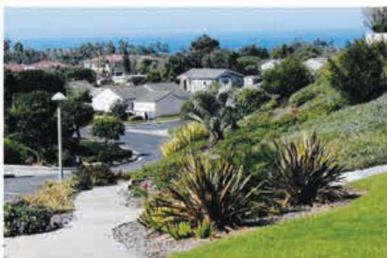
New Zealand Flax Phomium