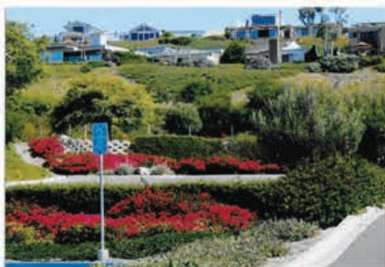
Bougainvillea & Olive Tree

We appreciate and enjoy the landscaping within our Community but how many of us can identify the beautiful trees and shrubs that we pass by daily? Thank you to the Garden Club for providing the following photographs and names of trees and florals that we pass on Niguel Shores Drive.