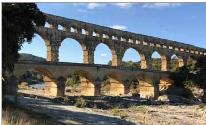
Pont du Gard