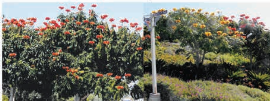
African Tulip Tree