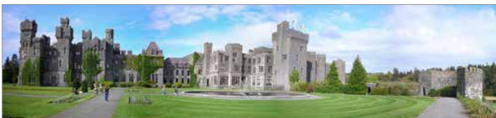
Ashford Castle in County Galway.