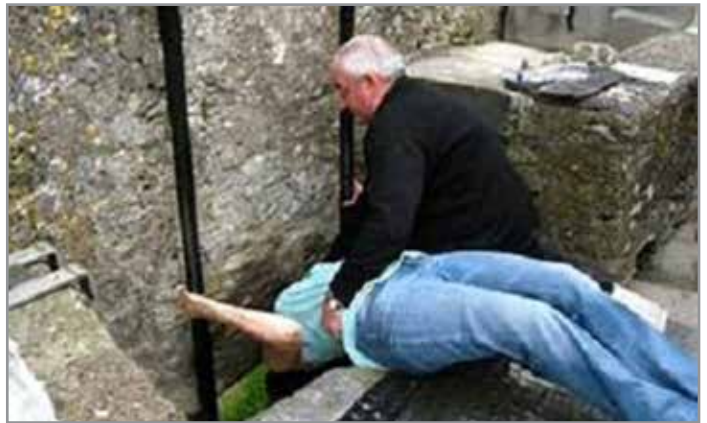
Kissing the Blarney Stone.