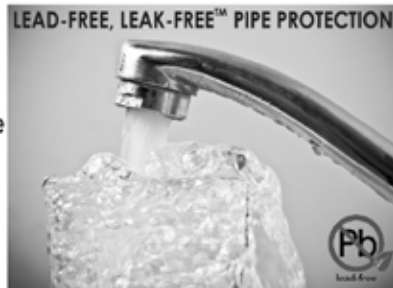
LEAD-FREE, LEAK-FREE™ PIPE PROTECTION

Mention this ad to receive UP TO $500 OFF of a whole house ePIPE Restoration