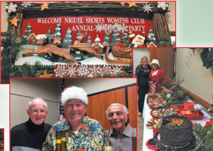
Women's Club Holiday Party