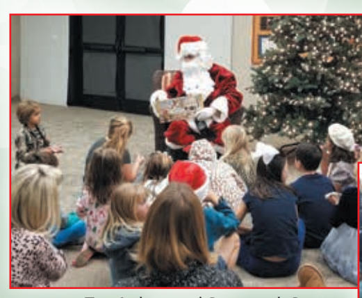
Tree Lighting and Stories with Santa