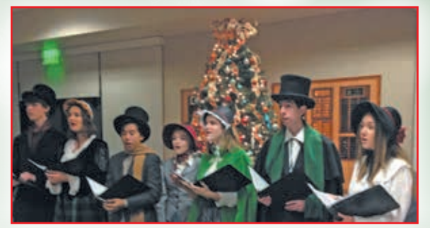
Men's Club Breakfast with Dana Hills Carolers