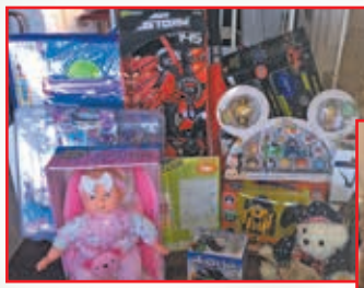
Holiday Toy Collection