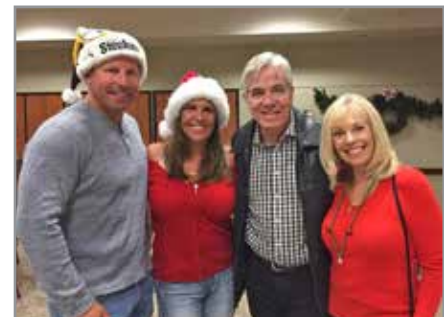
View more at www.niguelshores.org