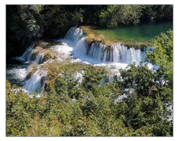
Waterfalls at Krka National Park.

On day trips we visited the historic cities of Mostar and Trogir, plus Krka National Park featuring beautiful waterfalls, ancient mills and historic dwellings.