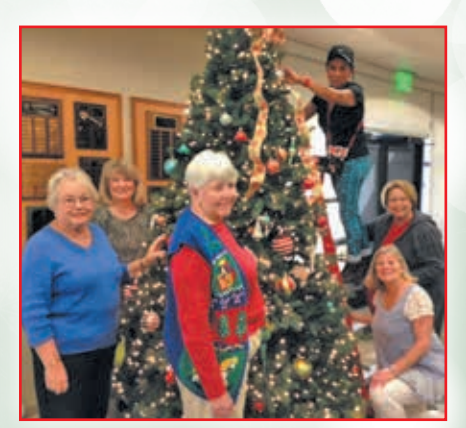
Decorating the Clubhouse