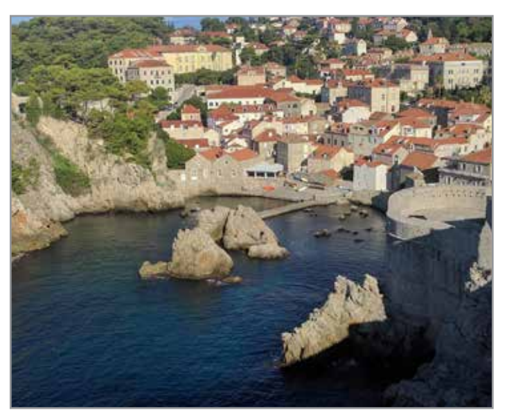
Dubrovnik's ancient fortress wall.

It was easy to travel between Split and Dubrovnik on the Krillo high speed Catamaran, stopping at the islands of Brac, Hvar and Korcula. On our way to Dubrovnik we stayed on Korcula for three nights in a penthouse apartment with beautiful views of the water and our own swimming dock.