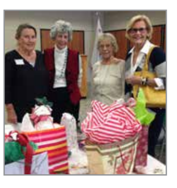
Page Turners gather for a holiday book exchange