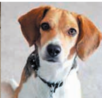
Doggie Licenses Page 13