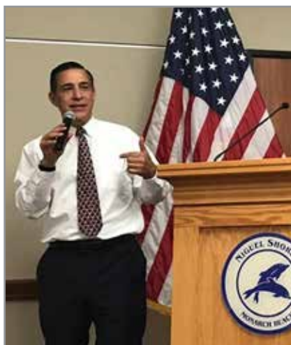
Congressman Darrell Issa speaking at Men's Club breakfast, August 2017