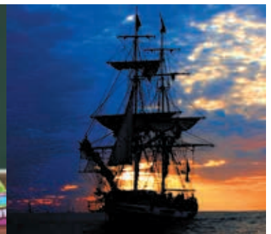
Tall Ships Page 19