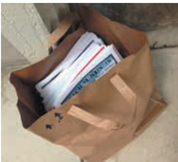
News Delivery Page 12