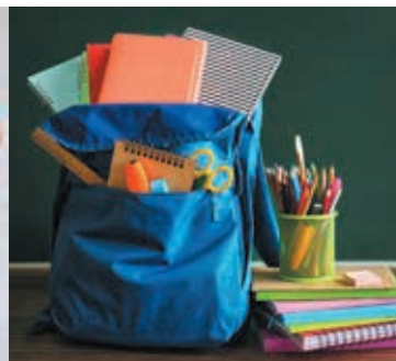
Back to School Page 14