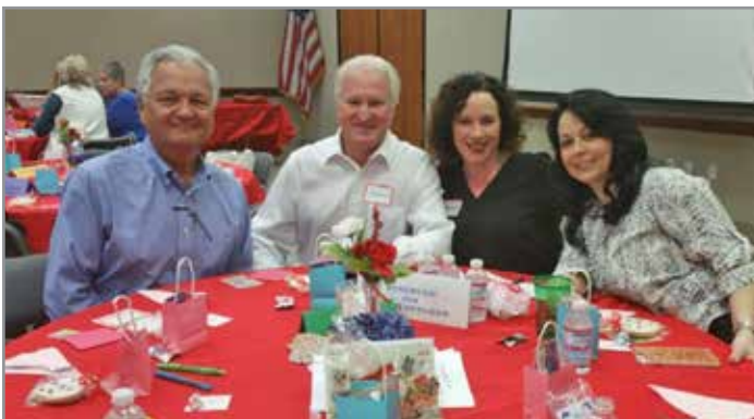
A panel of experts from Comfort Keepers, Atria San Juan, and Sterling Placements spoke in February about caring for our ill and elderly.

We’ve enjoyed so many excellent activities, programs, and luncheons together over the months since our 2016-2017 year began last June that we feel it’s worth a recap