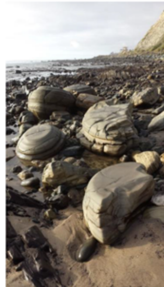
Beach at the Bluff - Jan 2016

I have a buyer looking for an ocean view home in Niguel Shores. Please contact me if you are interested in selling.