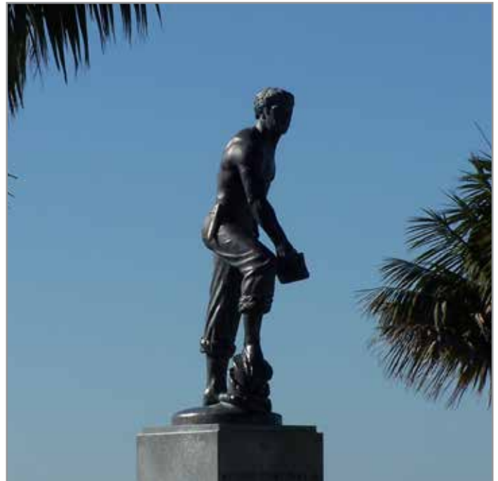
Richard Henry Dana Jr