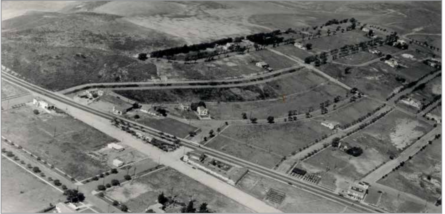
Aerial of Dana Point in the 1920s

Confused by the title of this feature article. Stay tuned, as I give here a brief history of our beautiful city—Dana Point.