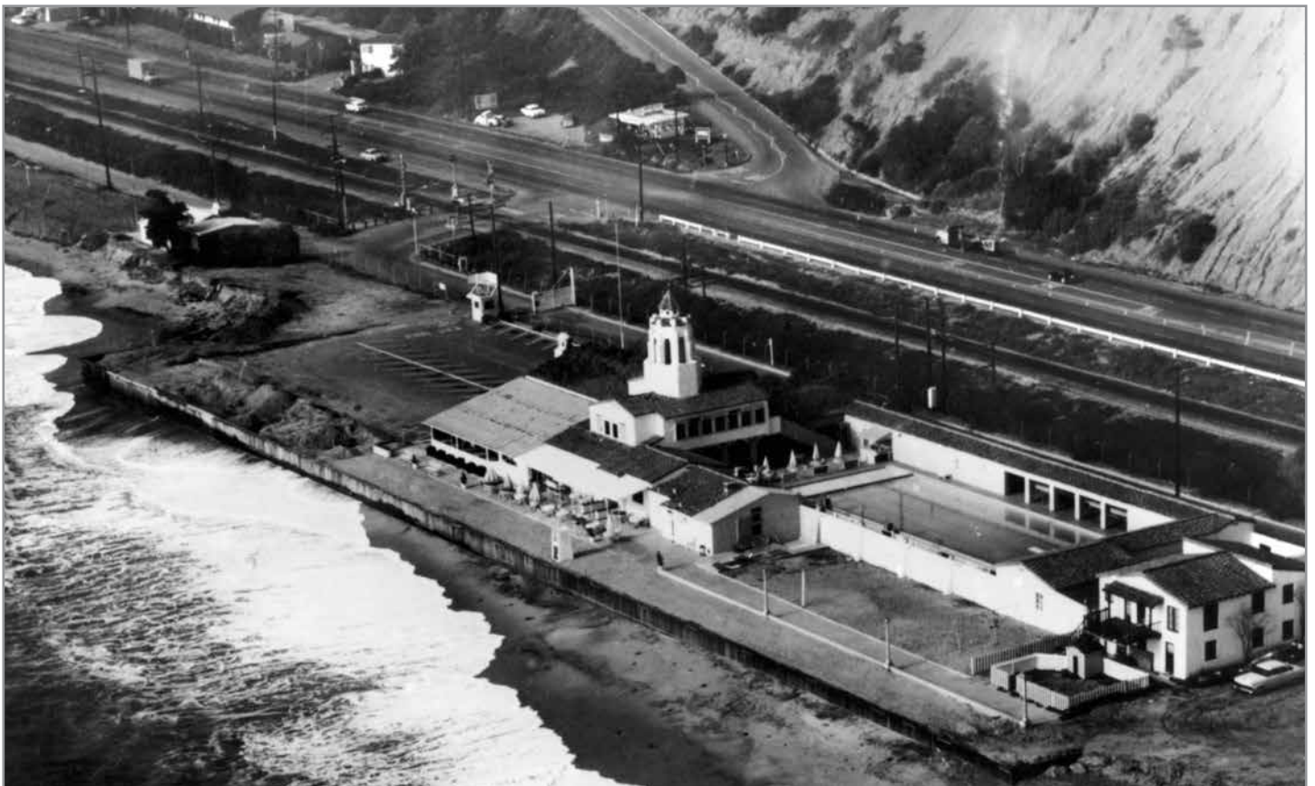
Capo Beach Club