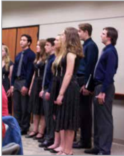
Dana Hills Vocal Group