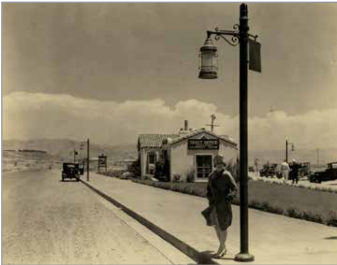
Lantern & Tract Office

For the next 30 or so years as the Los Angeles basin grew eastward and southward the Capistrano cove area became a beach destination for citizens inland from the coast because of the availability of train service from LA to San Diego. However, in 1924, San Juan Point, the first subdivision in Dana Point, opened with cross streets named for colored ship lanterns. (As a side note, the current improvements to the new downtown Lantern District includes restoring some of those colored street lanterns.)