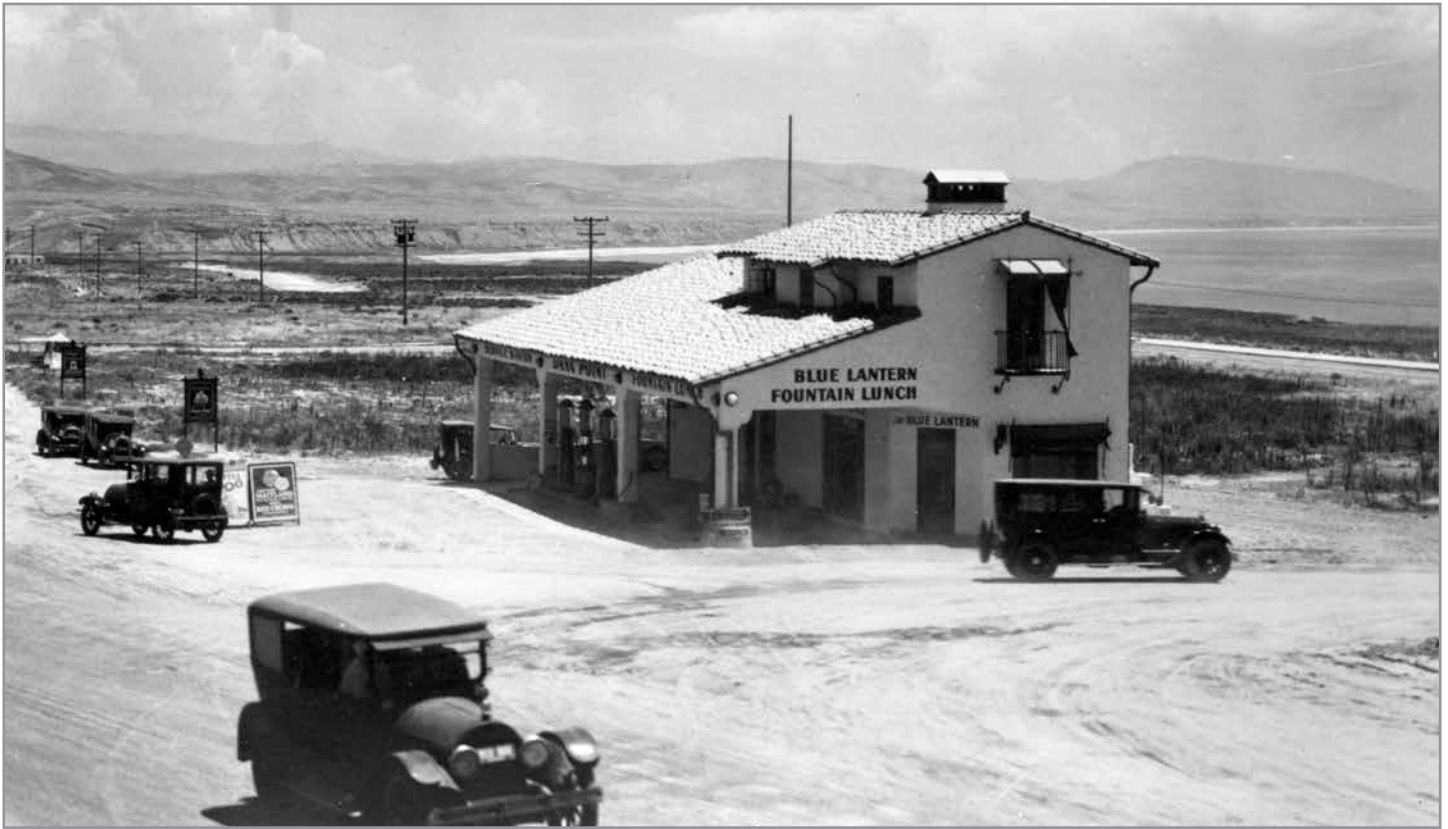
Blue Lantern Lunch

Doheny family was sold in 1944 marking the end of the Doheny era.