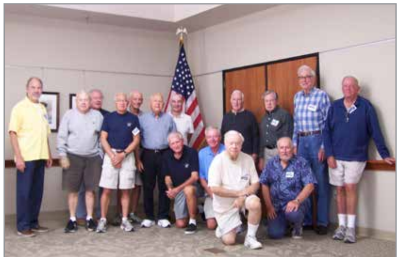
Men's Club Veterans

Today, it oversees the assessment of property taxes and collection of more than 33 taxes and fees. These state revenues