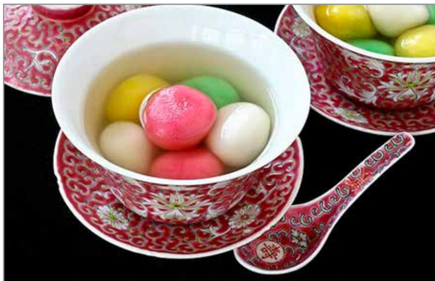
Dongzhi Festival rice flour balls

Yule was a midwinter festival practiced by Germanic tribes. It is believed that the celebration of this day was a