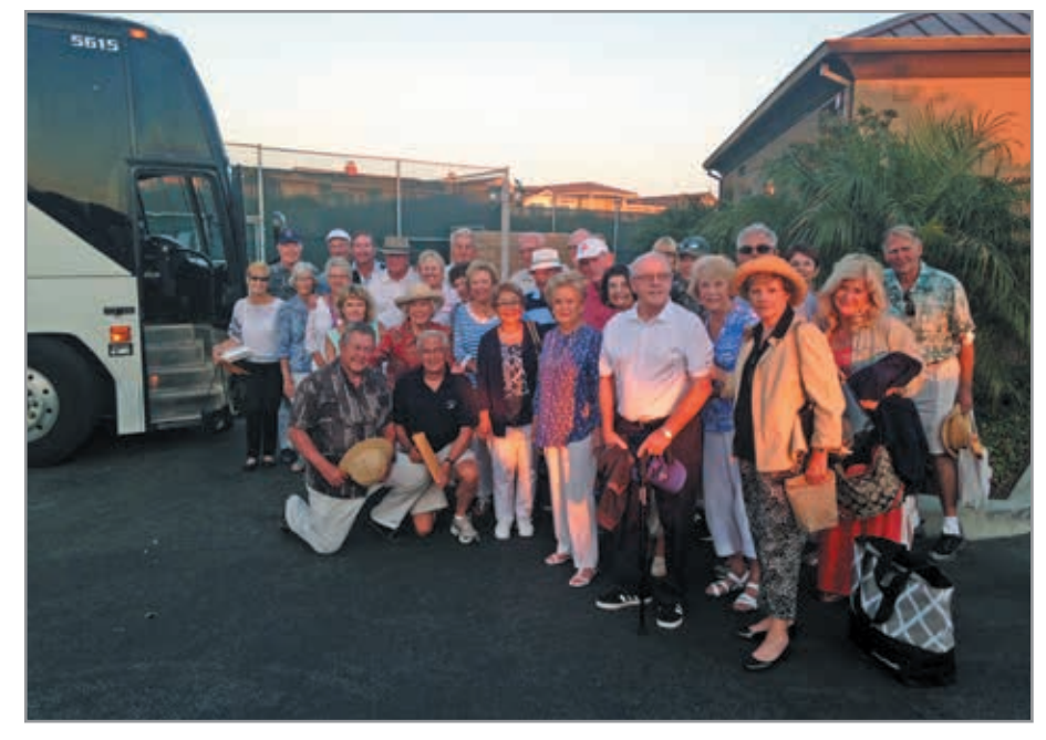
Off to the Del Mar Races (Smiling before Betting)

If there is a matter that you wish to be addressed by Management or the Board, please either make an appointment to meet with me, submit your concerns in writing or speak with a Board member. Staff has been trained to treat all Homeowners, Guests and other invitees courteously and with respect and it's only fair that they receive the same treatment. While some believe that rudeness and incivility is a lack of manners, others have said that it is a sign of weakness. Whatever the reason, there is no excuse for treating people with a lack of respect and professionalism.