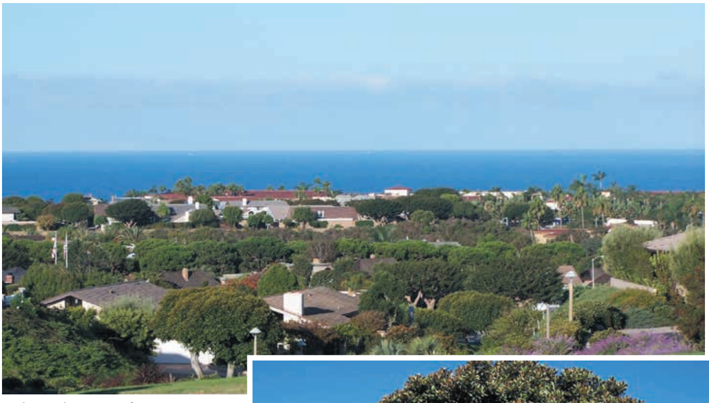
Unobstructed Ocean View from Many N.S. homes.