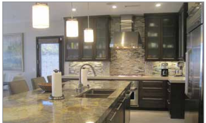
Home Tour - A beautiful Kitchen