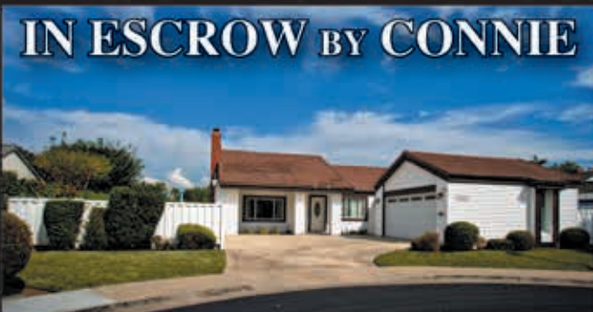
33392 PADINA CIRCLE