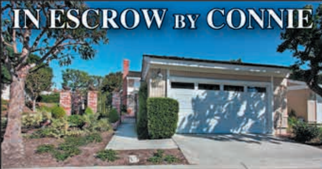
33902 FAEROE BAY