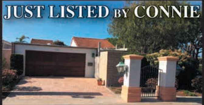
23781 TIMOR BAY