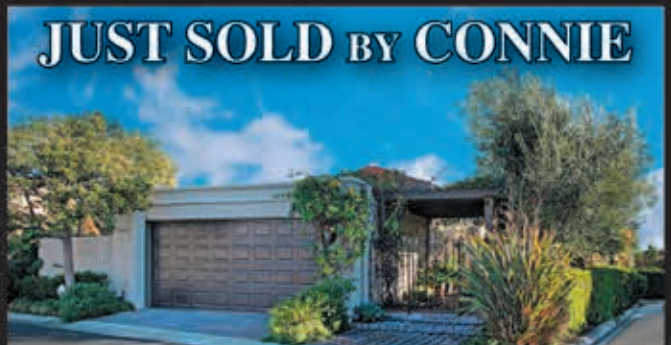
24172 VISTA D' ONDE