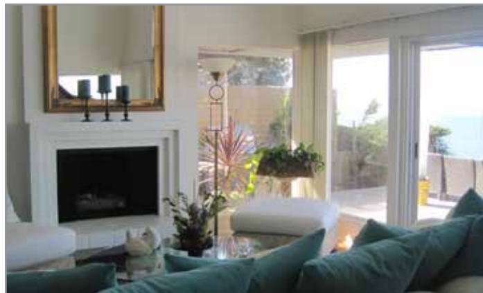
Home Tour - An elegant Living Room

Some history: Twenty-seven years ago members of the Niguel Shores Women's Club thought it would be interesting for their members to visit homes in Niguel Shores that had been recently remodeled. They promptly started a home tour. As far back as our records reflect, the first Home Tour was in 1989 and one has been held almost every two years since. One of the objects of the tour, other than the pleasure of visiting beautiful homes, has been to demonstrate what can be done to our 1970s houses to update and modernize them. No doubt, many of those 1989 and subsequent remodels have had extensive remodeling since and some have been completely torn down and rebuilt. Whenever possible, the organizers like to include homes from the different areas of Niguel Shores and different models within those areas. This year, we are going to have two townhomes that are the same model; however, you will be able to see two totally different ways of looking at the same home. What fun! Over these many years, a total of 77 homes have been shown from all the different areas in Niguel Shores, and this year there will be five more.