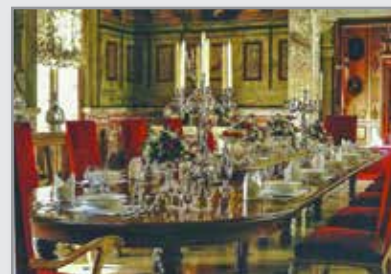
A small winter dining room.