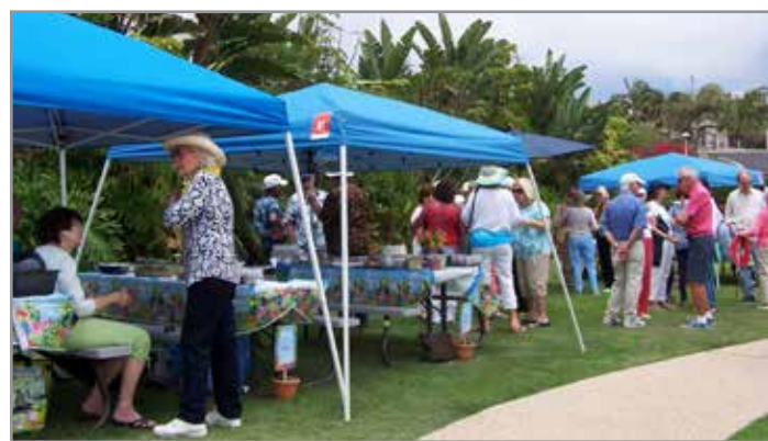
Garden Club BBQ