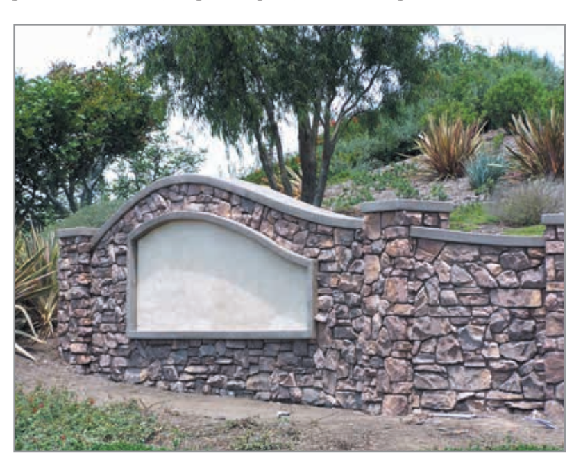
Monument lettering unavailable at press time.

Our new, modern structures that we call Monuments are a perfect representation of the unique character of our community. It represents the special position Niguel Shores (N.S.) has within the city of Dana Point (D.P.). Specifically, we are the only community within the city (and state for that matter) that owns a bridge across Pacific Coast Highway (and definitely a bridge to somewhere), one of the few communities along the southern California coast that has its own