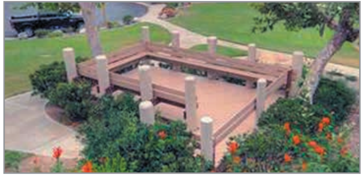
After: The new Observation Deck