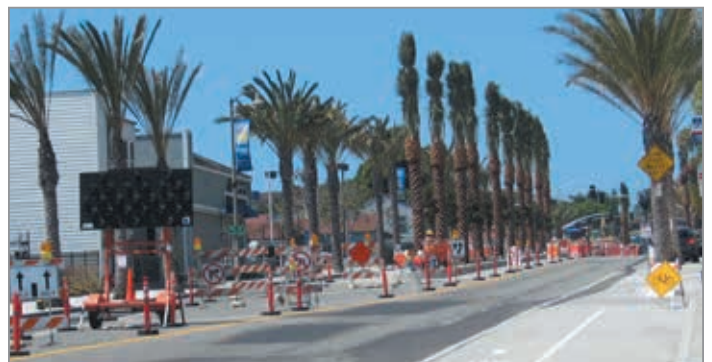
Pacific Coast Highway under two-way renovation August 2014

If you drove up Pacific Coast Highway (PCH) through Dana Point over that last six months you have seen the city's