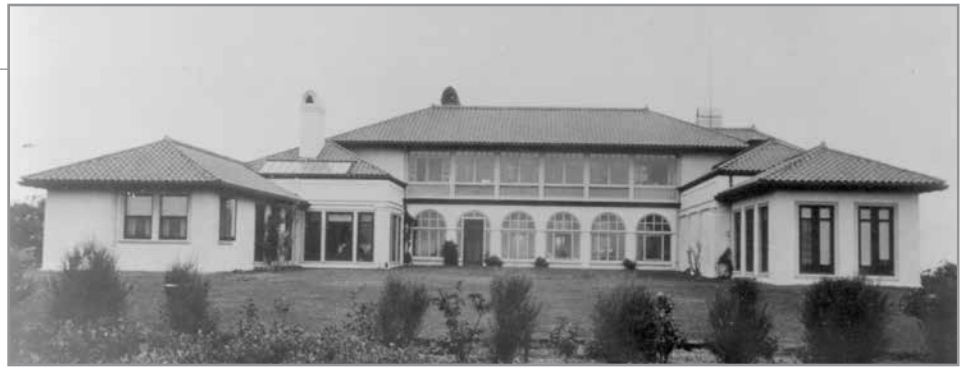
100-year-old Dolph House in Dana Point