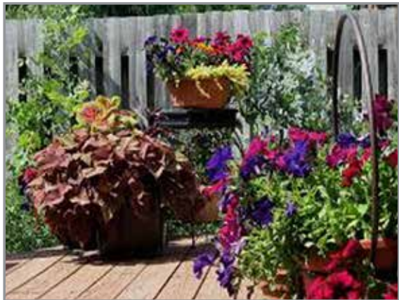
Gardening in pots

Our annual Lobster Fest will be held on October 30. Mark that date.