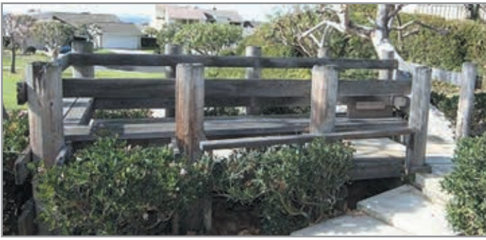
Before: The old Observation Deck