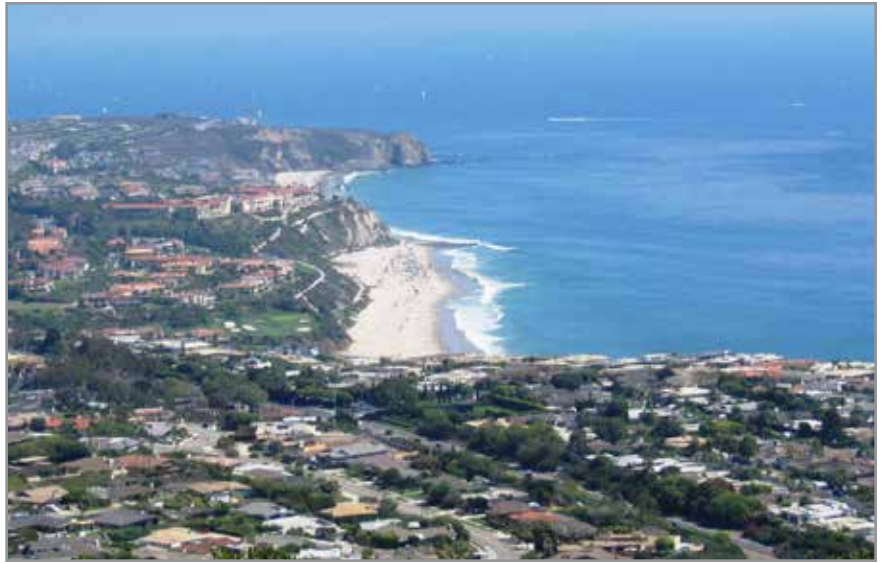
View looking south from Niguel Hill

After contemplating this evidence of our ancient history, follow along the sandy path a bit further to arrive at a wide well-tended walkway that continues along below the grand houses all the way to the end of the hill with spectacular views below and north along the coast and, proceeding around the end of the hill until you are looking south, you can see the whole of Niguel