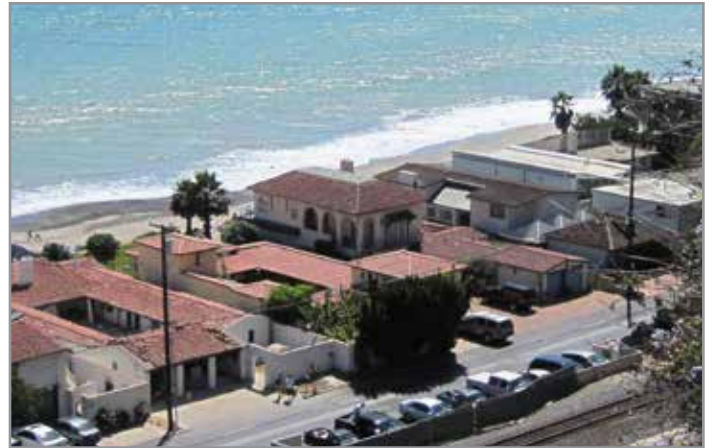
Three 1930 Doheny Houses on Beach Road