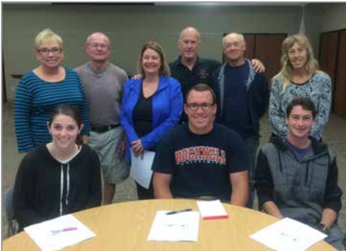
Niguel Shores residents who completed the AED/CPR Class.