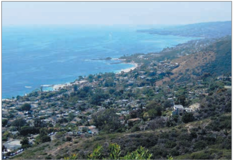
View from Niguel Hill looking north

I wonder how many of our Niguel Shores residents have been to the top of Niguel Hill, that most notable feature in our view just to the north. The hill is 900 feet high and, for those of us above PCH, quite prominent, and particularly beautiful at night with the lights of the houses twinkling all the way to the top. There are two interesting and educational public parks to visit atop the hill, the first of which you will find by a small sign about two thirds of the way up Pacific Island Drive which says, "View Park." Turn to the left and left again and drive to the end just before the gate to the community atop the hill. Park along the street and you will find the entrance to a county park on your right at the end of the street.