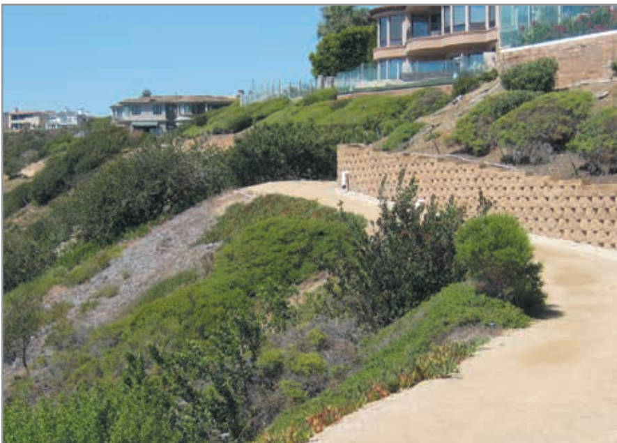
The pathway around Niguel Hill

This park, called Badlands Park, has some picnic tables and two paths to explore—one off to the right below houses along the ridge. The other, a sandy path leading off to the left along which you will soon come upon a sign that reads, "During the Pliocene age, about ten million years ago, the eroded sandstone slope face you see before you was part of a sandy beach. Through uplifting of the earth's surface, this ancient beach now stands about 780 feet above the current sea level." There is more information that you can read when you visit.