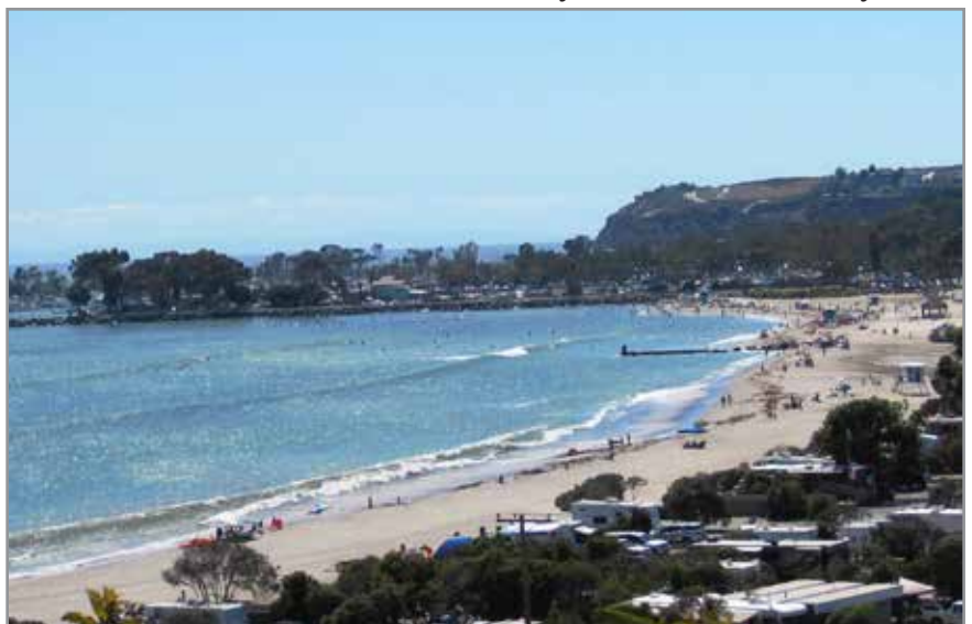
View of Doheny State Beach from Louise Leyden Park

The second park is further up Pacific Island Drive to the top where you should turn left on Talavera and proceed to the end just before the gate to yet another hill-top development. Here is another park affording wonderful views down the Aliso Creek Canyon and, as you walk along the path there are picnic tables and a surprising display of natural California flora—no doubt fauna, too, on occasion. Many of the plants are named on signs along the way and, at the very end, another view of the hospital and houses below and, on a clear day, the coast far to the north.