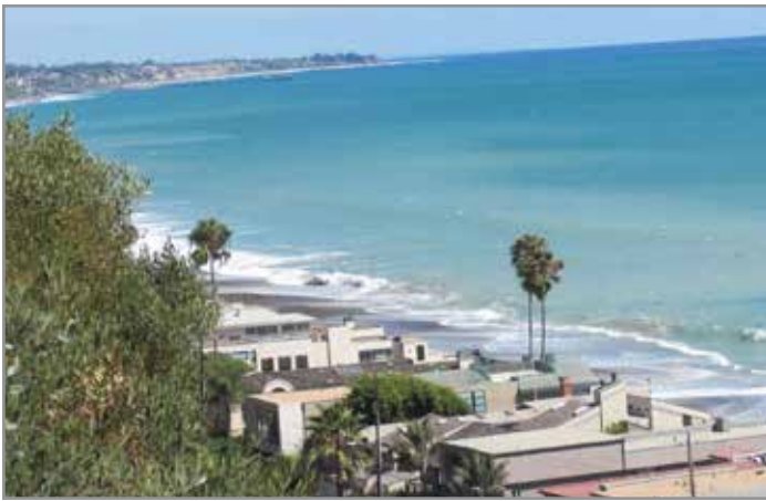
View of south coast from Chloe Luke Overlook

for many years in Capistrano Beach. This park affords an excellent view of Doheny State Beach full of sunbathers and campers this time of year. Also, the view of the harbor and other parts of Dana Point are different and interesting from this viewpoint.