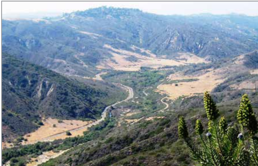
View of Aliso Creek Valley from Niguel Hill

Before going back to your car, walk along the green belt at the top of the bluff and look down where you may be surprised to see a large installation by the Water District hidden way back in Alison Canyon. After gazing out at the peaceful valley and then spying these seemingly mysterious buildings below the bluff, one can imagine James Bond finding Dr. No plotting some mischief down there.