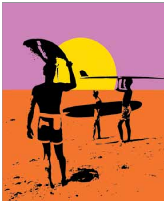
Poster for the film Endless Summer

The very earliest surfing in California is said to be when George Freeth, a Hawaiian surfer came in 1907 and demonstrated surfboard