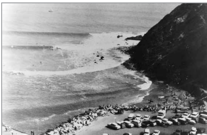
Surfer's and their cars in Dana Cove, site of the "Killer Dana"