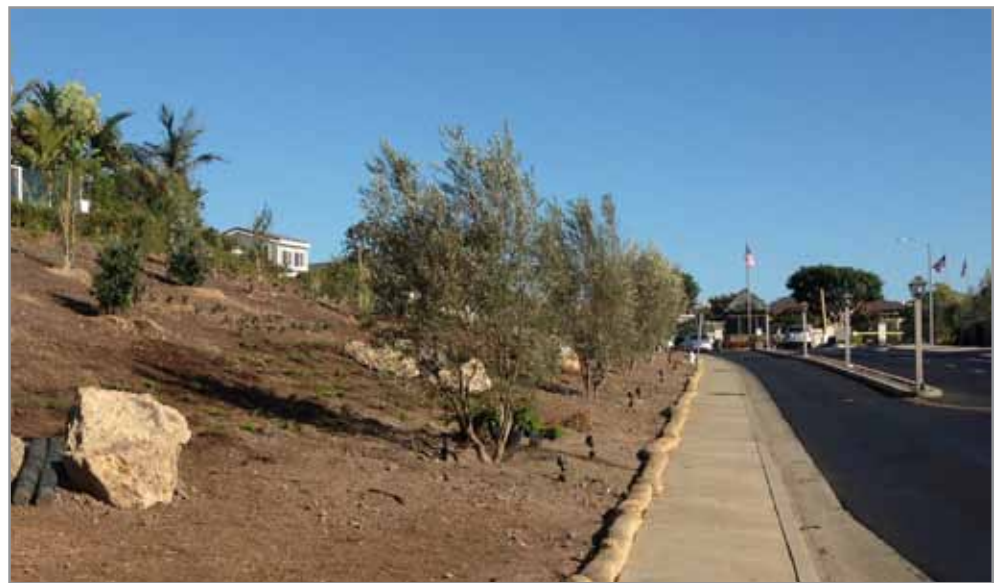
Mariner Entrance—New landscaping 9/13

Mariner Entrance: The new landscaping at the Mariner entrance is basically completed. The design, as promised, definitely provides a visually open entrance and provides a fresh, lighter ambiance to welcome you and your guests to the community. The new plantings provide texture