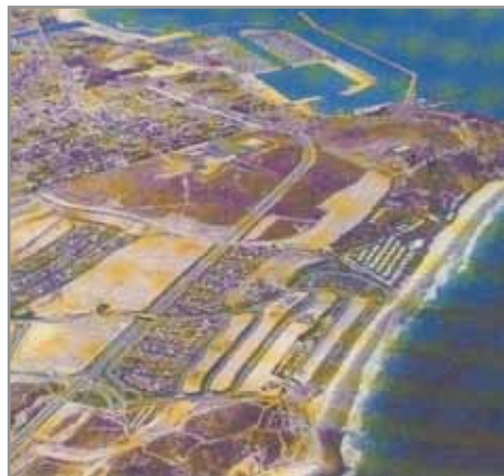
Niguel Shores Development—1970s

We have recently added a massive amount of information to the Website which we think may be of interest to many of our residents. The addition is mainly a collection of copies of the early sales brochures for the different areas of Niguel Shores which include information about the architects who designed homes in each area, drawings and floor plans of the homes, some contemporary photos of the homes, original prices, plat maps and some contemporary prices.