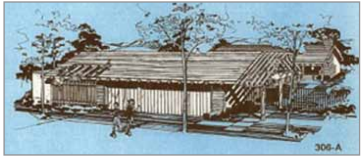
Broadmoor Home – Drawing above, floor plan below

Breakers Isle was called The Seagate by the Developer. The brochure states: Situated on a natural promontory 75 feet above the beach sand, The Seagate represents one of the West's finest examples of a vanishing commodity: treasured ocean-view property. ...Selectively placed at strategic points of The Seagate, in order to take maximum advantage of its setting, are home sites of remarkable caliber. ...Home sites are available at The Seagate in the $130,000 range, fully prepared for building. Streets, community landscaping, underground electricity and water are completed. The Seagate is indeed the ultimate choice.