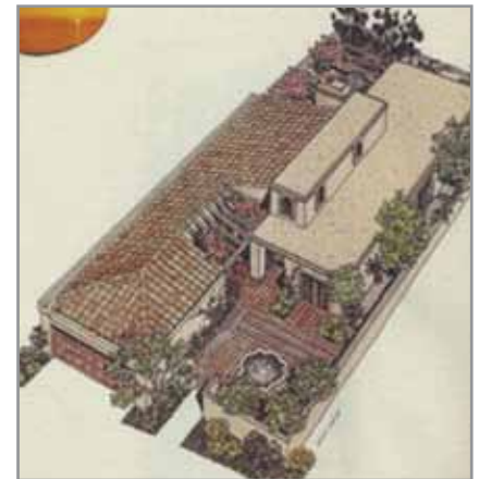
Drawing of Capri Model