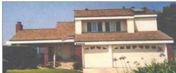
Berkus Home Model 207 above, floor plan at left