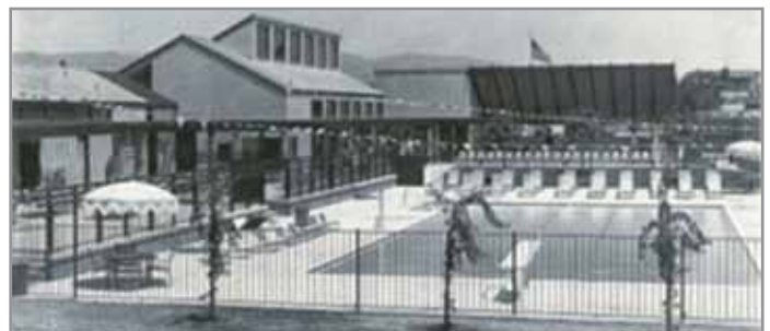
At right: Community Center opening day June 13, 1973.