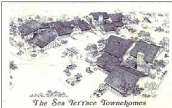
Samples of items available on the Website under Niguel Shores Development