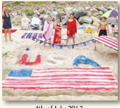
4th of July 2012