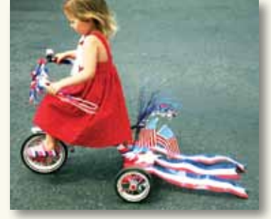
4th of July 2013

8:00-10:30 a.m. ClubHouse Breakfast by Men's Club 10:00 a.m. Flag Raising and Neighborhood Parade Games in the Park 11:00 a.m.-noon 11:30 a.m. Hot Dogs Poolside Sandcastle Registration 12:00 noon 3:00 p.m. Sandcastle Judging 5:00 p.m. Sandcastle Awards on the Bluff 4:00-9:00 p.m. D.J. on the Bluff BBQ ready for grilling on the Bluff 5:30 p.m.