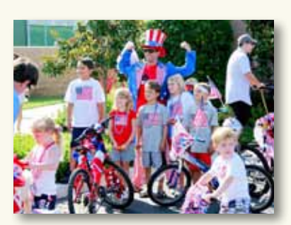
4th of July 2011

Categories: Sand Fleas — kids and teens (no adults) Sand Tribes — all ages (must include adults) Judging based on creativity, imagination, originality and sculpting skill and detail.