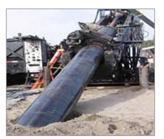
Slant well installation

Still confused? Don't know what "100 Cubic Feet" means in everyday, nonengineering language? Well if you