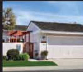
33682 HALYARD DRIVE