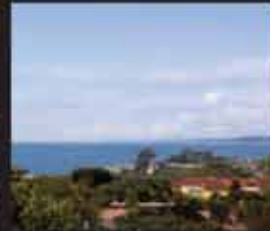
33855 MANTA COURT