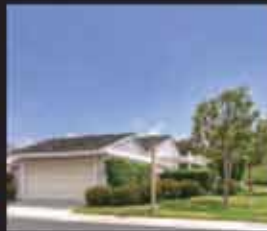
33692 HALYARD DRIVE