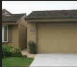
33441 SPINNAKER DRIVE