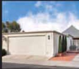
23901 TARANTO BAY