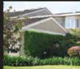
33551 CAPSTAN DRIVE