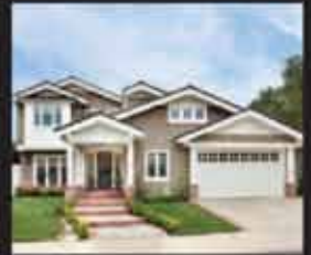
33511 PERIWINKLE DRIVE