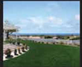
33575 BRIGANTINE DRIVE

Sending You Heartfelt Thanks and Wishing You A Happy New Year!