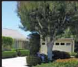
23741 MONTEGO BAY