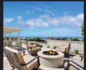
33631 CROSSJACK DRIVE