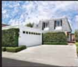
23655 TAMPICO BAY