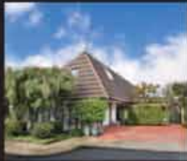
23651 TAMPICO BAY