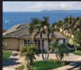
33831 NIGUEL SHORES