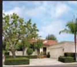
24171 VISTA D'ONDE