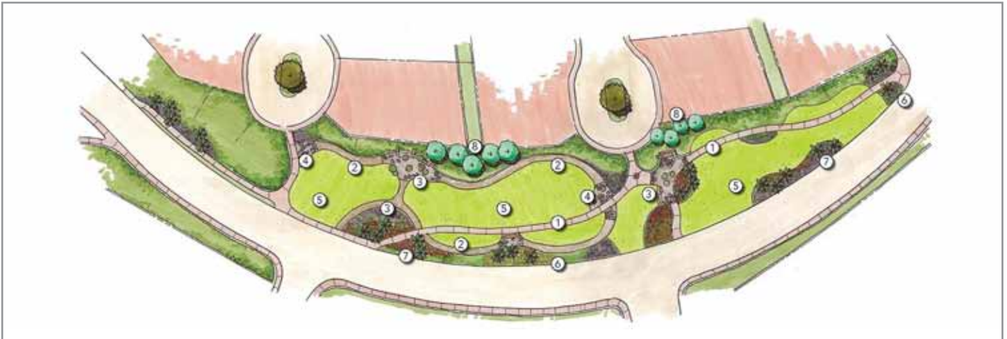
Drawing of plan for renovation of the Sunset Park along Niguel Shores Drive (opposite Halyard and Capstan)

On the regular landscape maintenance schedule, Harvest will be trimming and mulching all of the trees, removing dead plants, dethatching lawn areas, and adding seasonal color plants four times a year. Nate and Nacho both expressed concern about the coral trees that are old and branches are breaking off, especially when we have Santa Ana winds. They will be caring for these trees as needed. Trees in our community are important and, as we all know, can cause controversy between tree lovers and view lovers. As a consequence, no tree can be removed in Niguel Shores without the explicit approval of the Board of Directors. Harvest will be working with the nine area representatives on the Landscape