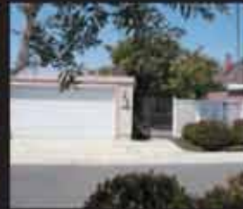
23881 CORAL BAY