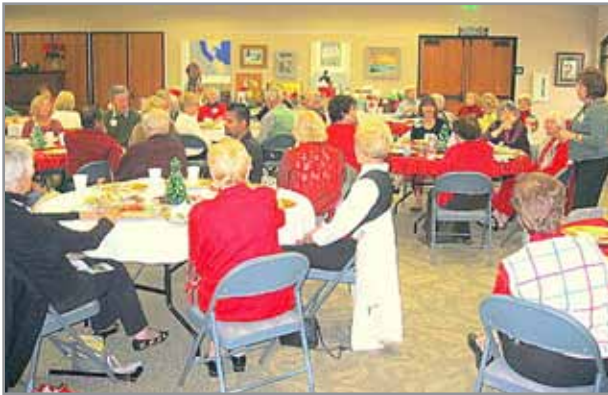
Garden Club Christmas Lunch.