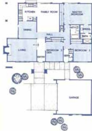
Model 118 Floor plan