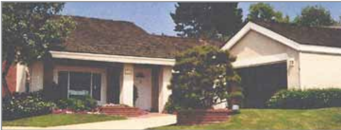
Berkus home Model 118