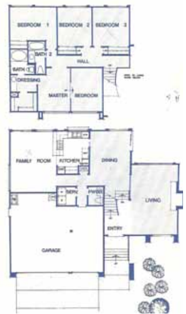
Model 207 Floor Plan

So, how do the Niguel Shores Berkus Homes manifest this architect’s design ideas? Have a walk or drive through that neighborhood and notice the many interesting designs of the homes there. There