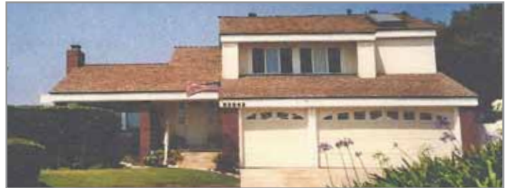
Berkus Home Model 207